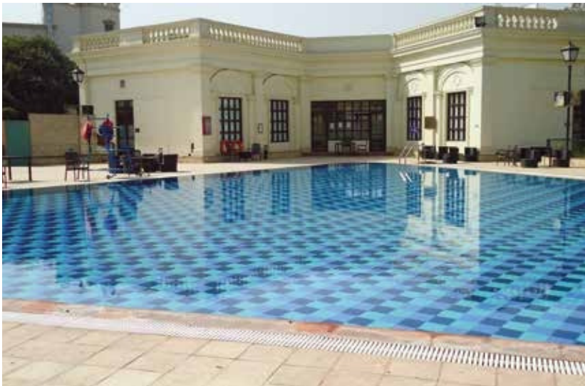
Actual image: Pool and lounging area

Immerse yourself in an exciting and dynamic lifestyle