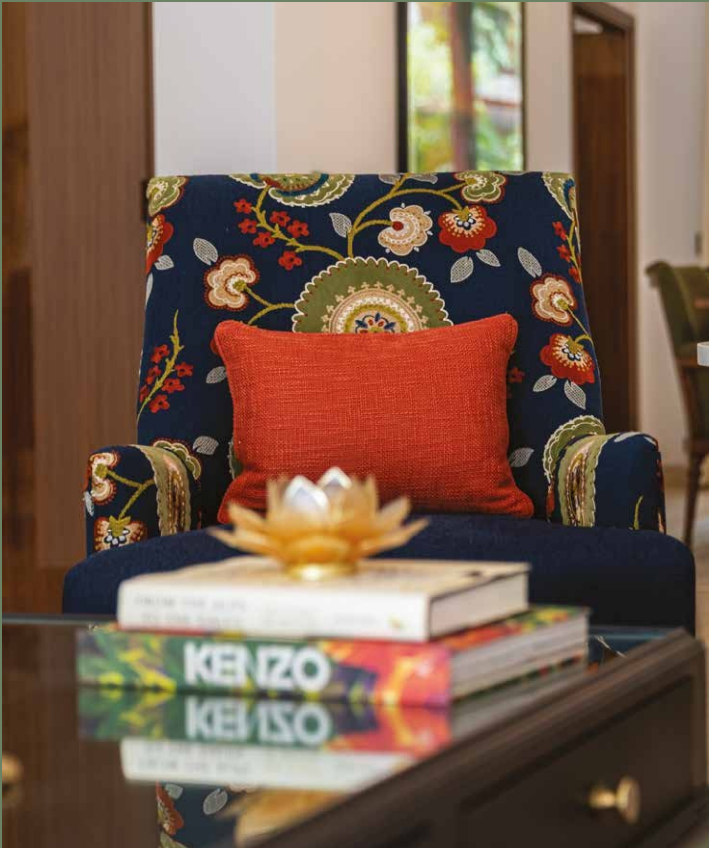
Actual Image: Independent Floors - Living and dining areas