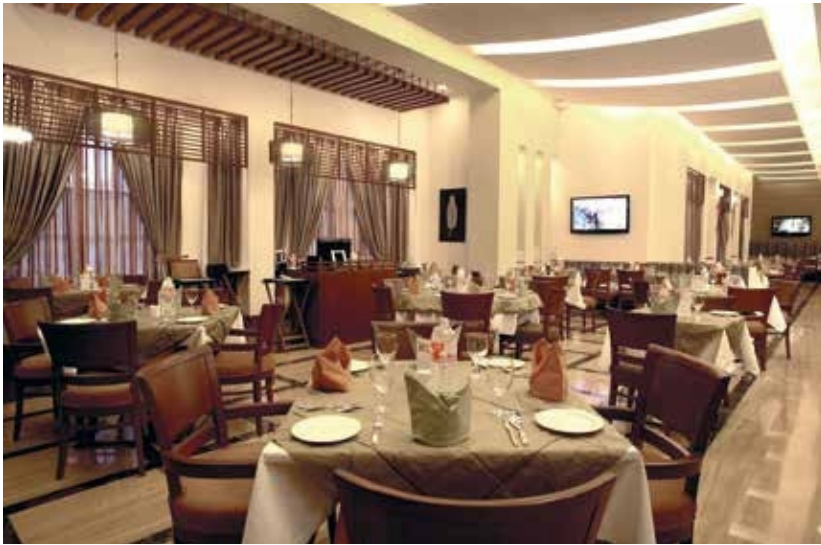
Actual image: The Restaurant