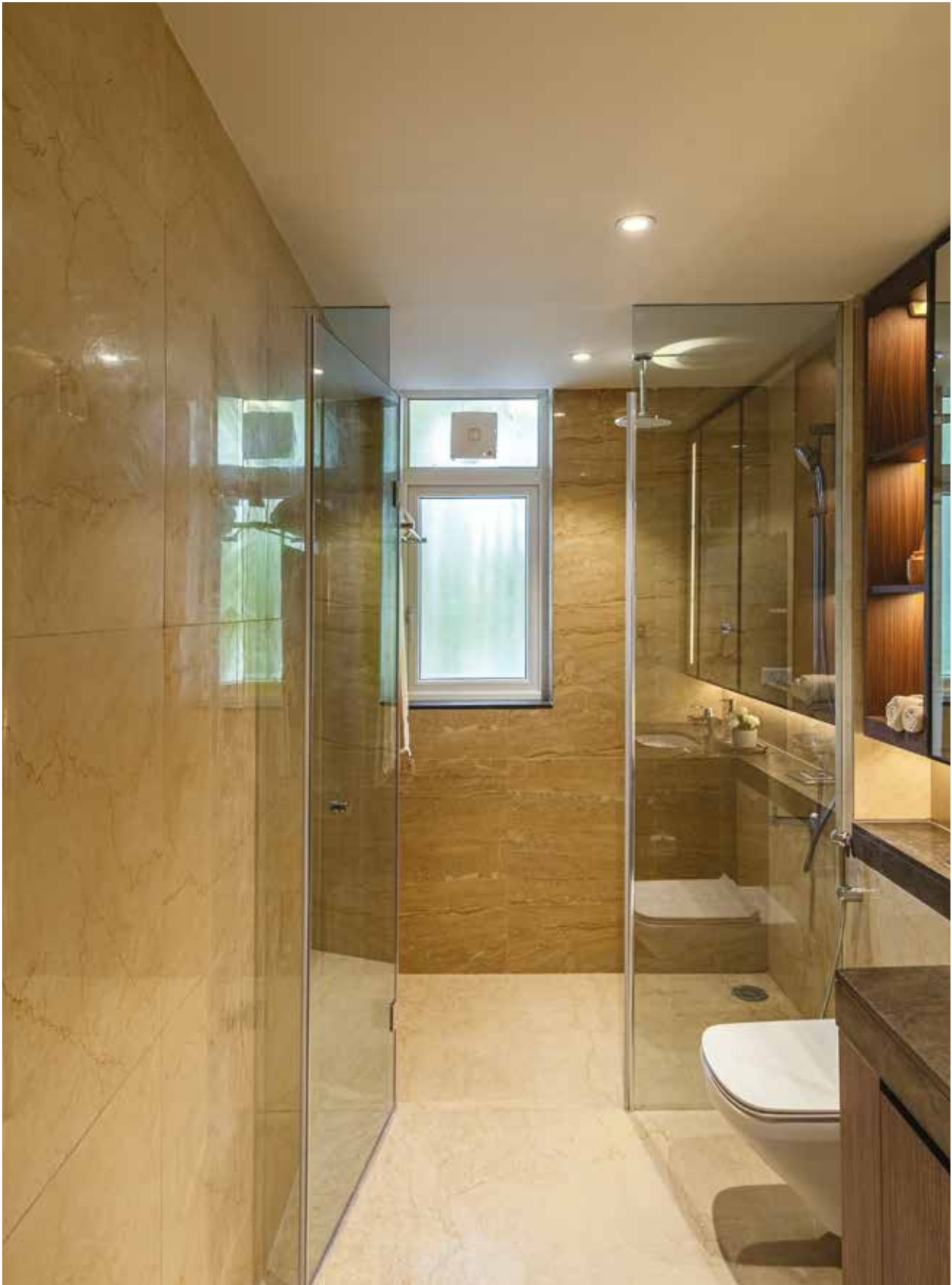
Actual Image: Independent Floors - Bathroom

All fittings, fixtures and furniture shown are for representation/illustrative purposes only.