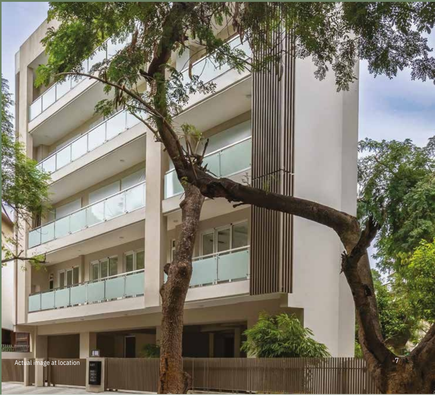
Actual image at location

Tucked away amidst these low-rises lies an exquisite selection of homes, providing unparalleled privacy, abundant natural light, enhanced cross-ventilation, and breathtaking vistas in proximity to beautiful parks and green spaces. Every dwelling is meticulously crafted to encompass dedicated staff and storage spaces in the lower levels, in addition to secure parking spaces.