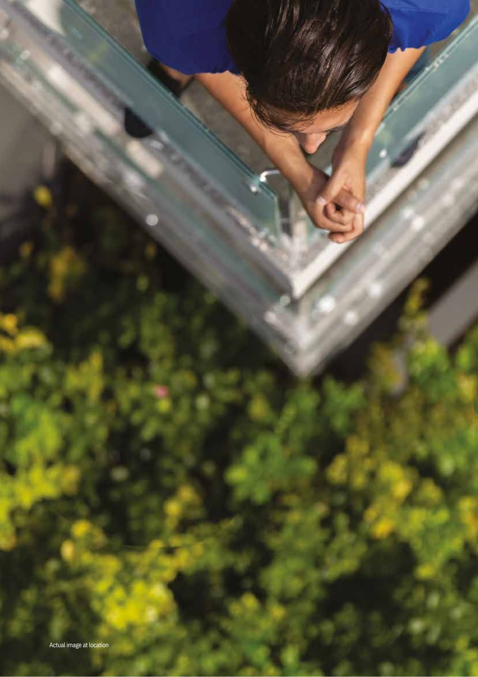
Actual image at location