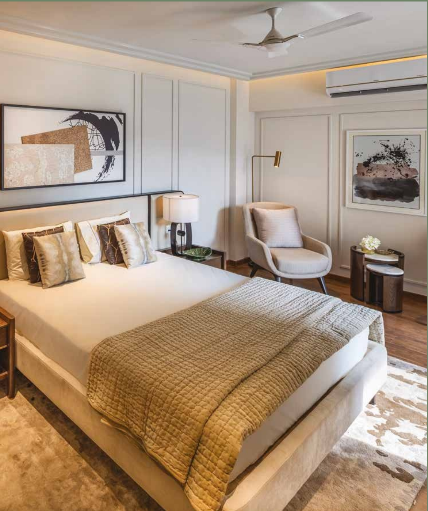
Actual Image: Independent Floors - Master bedroom

All fittings, fixtures and furniture shown are for representation/illustrative purposes only.