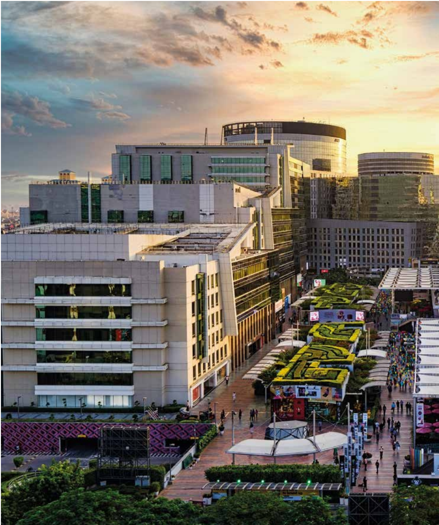
Actual image: DLF Cyberhub