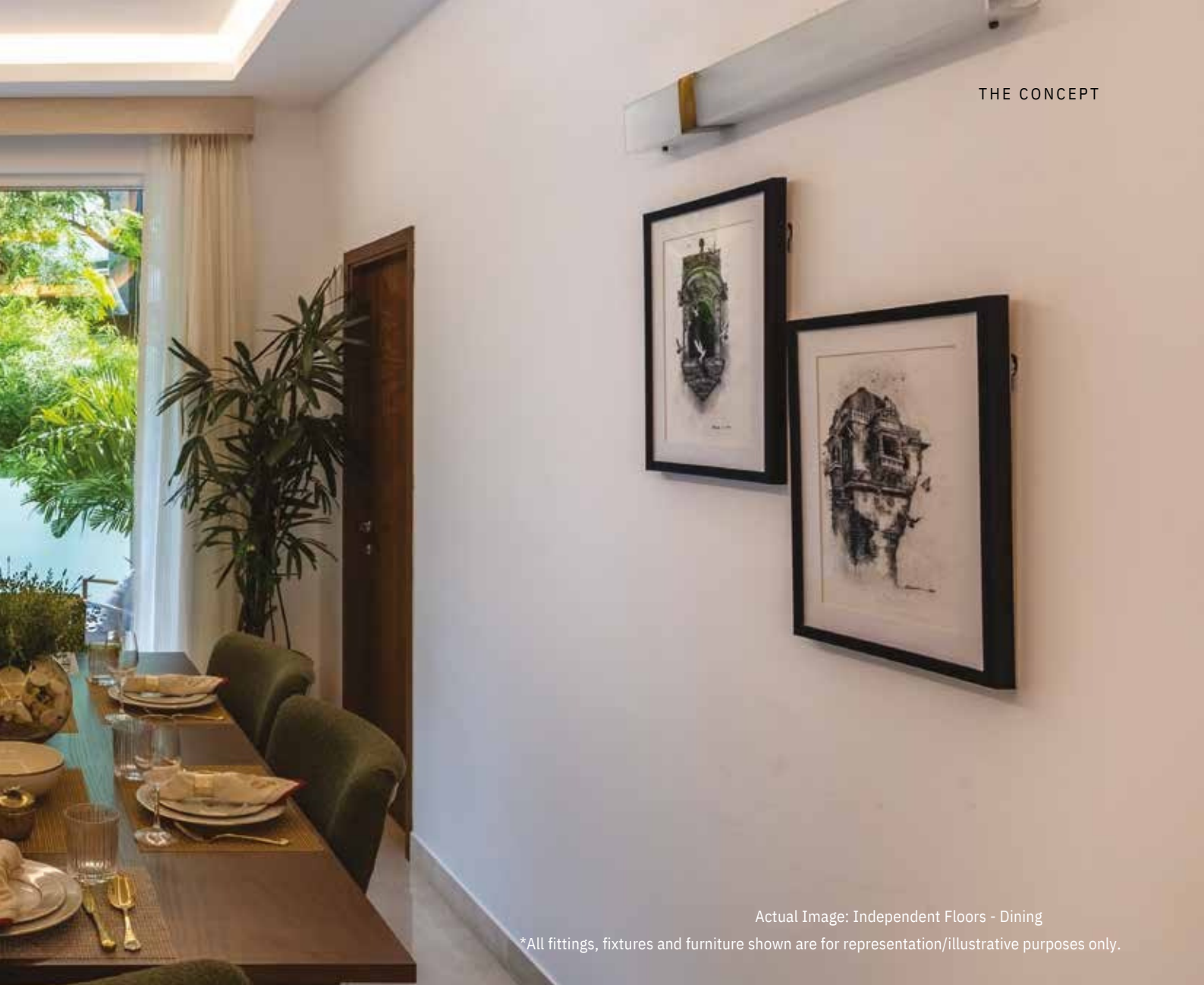
Actual Image: Independent Floors - Dining

*All fittings, fixtures and furniture shown are for representation/illustrative purposes only.