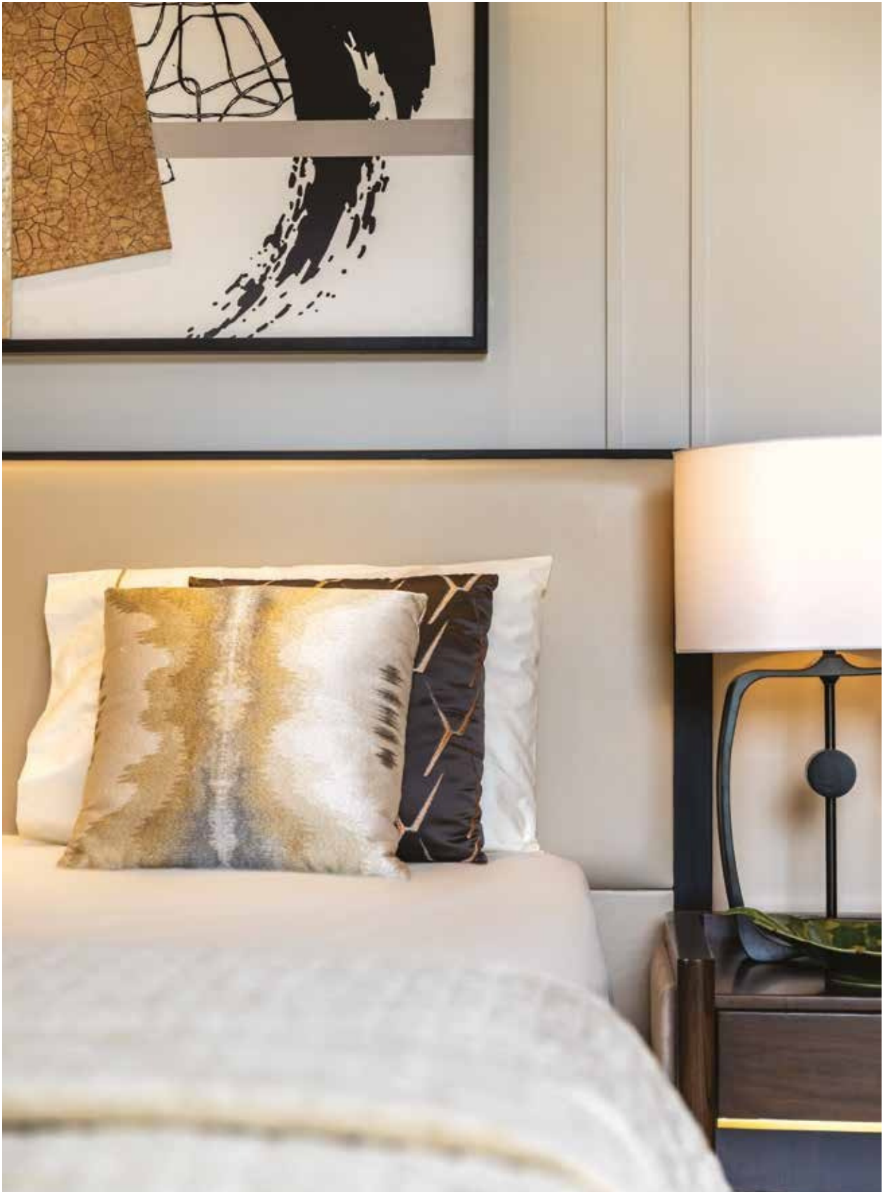
Actual Image: Independent Floors - Bedroom All fittings, fixtures and furniture shown are for representation/illustrative purposes only.